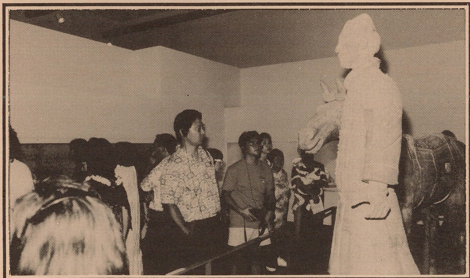
Without the generous support of the Hawai'i State Foundation on Culture and the Arts exhibitions like would not have been possible!

The U.S. Army's Museum's commemorative exhibit, Unconditional Surrender , will remain open to the public until March 31, 1996. ♣